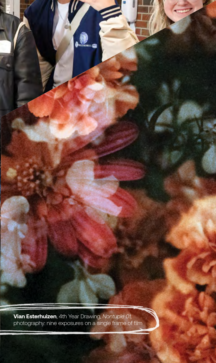
Vian Esterhuizen, 4th Year Drawing, Nontuple 01 , photography: nine exposures on a single frame of film